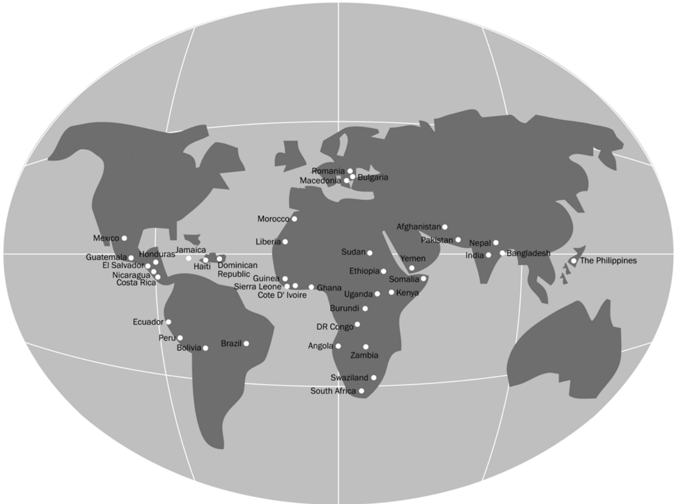
Figure 1: Countries of BEPS Activities